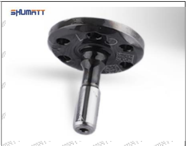
Custom Valve Core (white color without coating)