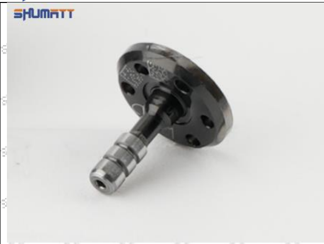
Custom Valve Core (white color with two grooves)