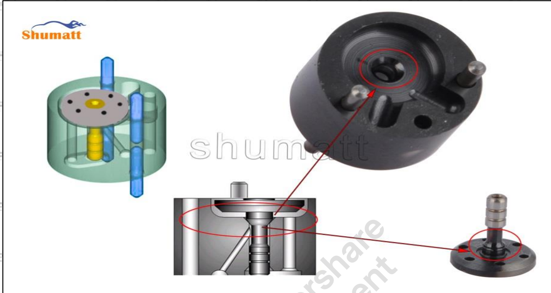
Pic No. 1