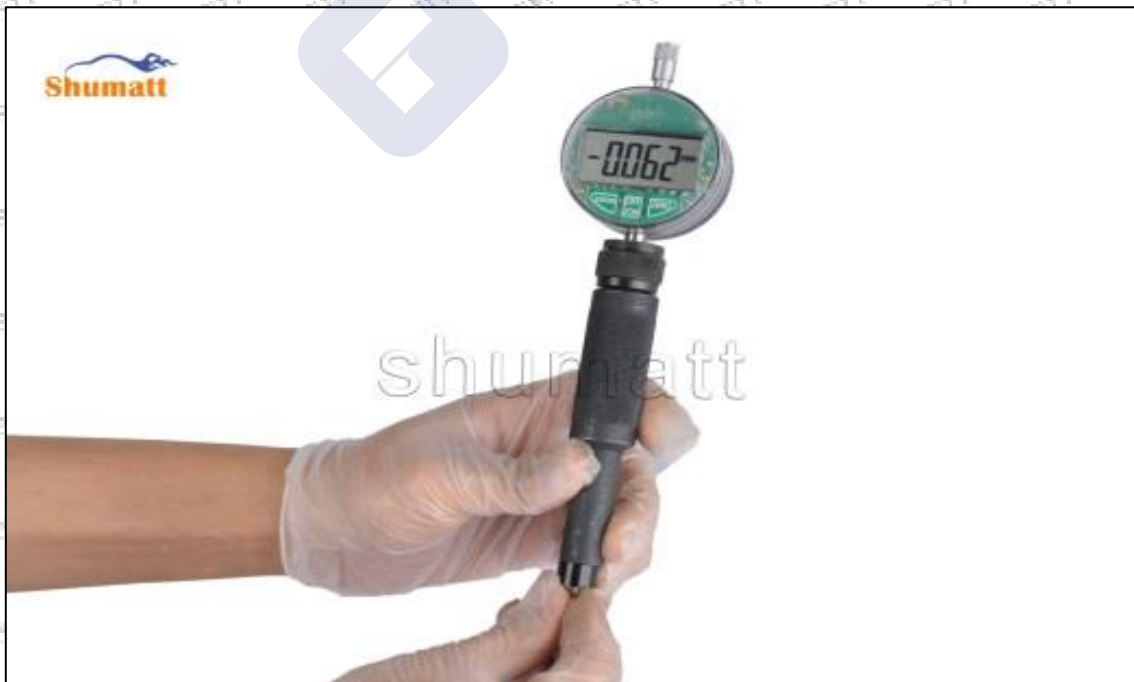
Pic No. 2