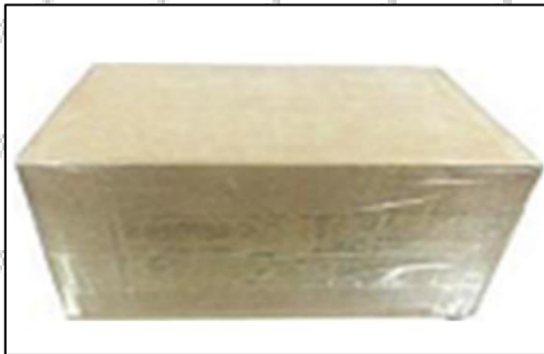
Pic No. 1

Domestic express packaging: Wrapped by Transparent tape