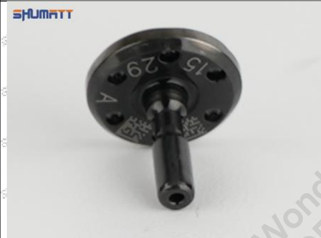
Custom Valve Core (black color with coating)