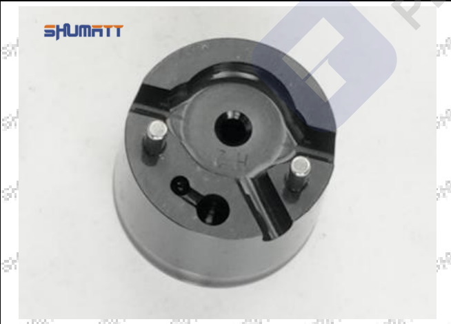
Custom Valve Body (three grooves)