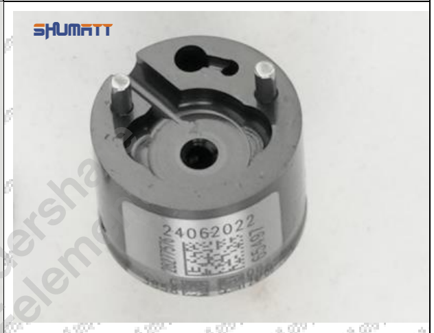
Custom Valve Body (single groove)